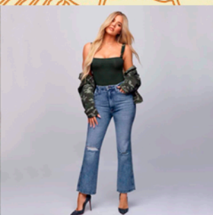
Good American Good Flare Deco Yoke Jeans in I132

Bohemian Chic has made its way back into the fashion world this 2022. Influences like Woodstock has inspired this trend to come back this season. This includes many boho patterns and earth tone colors. This shopping page will include maxi flowy skirts, cowboy boots, leather jackets with fur and much more. So, get your hands on these upcoming pieces!