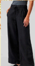
Cabo Linen Wide Leg Pant