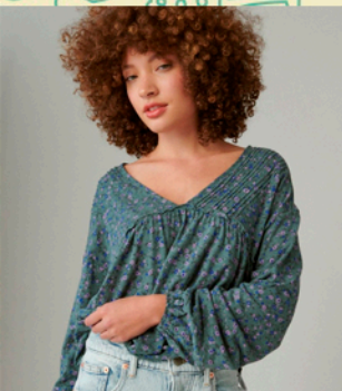
Patchwork Long Sleeve Peasant Top