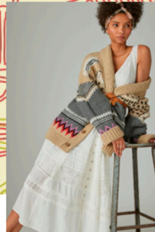
Lace V-Neck Maxi Dress