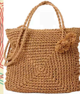
Kim Rogers® Crochet Straw Tote with Tassel